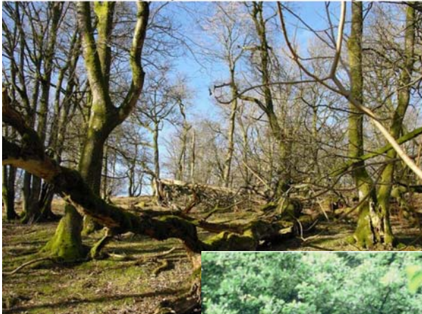
A woodland grazed by sheep and browsed by roe deer. The fragmented canopy and lack of regeneration suggest that there is an urgency to reduce herbivore impacts.

The questions were devised to minimise any ambiguity or uncertainty. The emphasis is on current, as opposed to historic impacts. The following indicators are used: