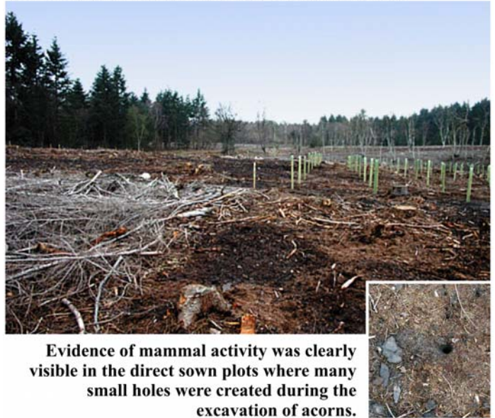
Evidence of mammal activity was clearly visible in the direct sown plots where many small holes were created during the excavation of acorns.

Centre of one of the experimental blocks showing control area with brash remaining after harvesting, and cleared areas that have been planted, sown or left to colonise naturally.