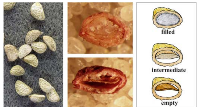
Bramble seeds extracted from the fruits (left) and cut in half in order to assess their quality (right): filled or empty. Intermediates counted as filled if the live tissue filled more than half the seed.

We then extracted the seeds so we could assess their quality using a microscope. A seed was either filled with live embryonic and storage tissue or it contained a collapsed embryo whose tissue was dry and shrivelled.