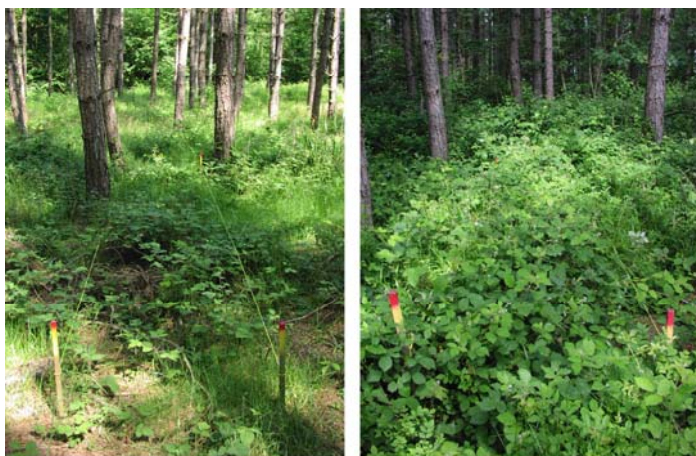
Permanent assessment quadrats for bramble, 1m wide and 5m long, on PAWS restoration experiment, showing different amounts of bramble.

Bramble is regarded as one of the worst forest weeds, especially in relation to natural regeneration, because it is very vigorous and competes strongly with tree seedlings. Within our recent PAWS restoration experiments we have gathered a wide range of data on the vegetative growth and fruiting of bramble in permanent assessment quadrats over a number of years, and in relation to different forest thinning treatments.