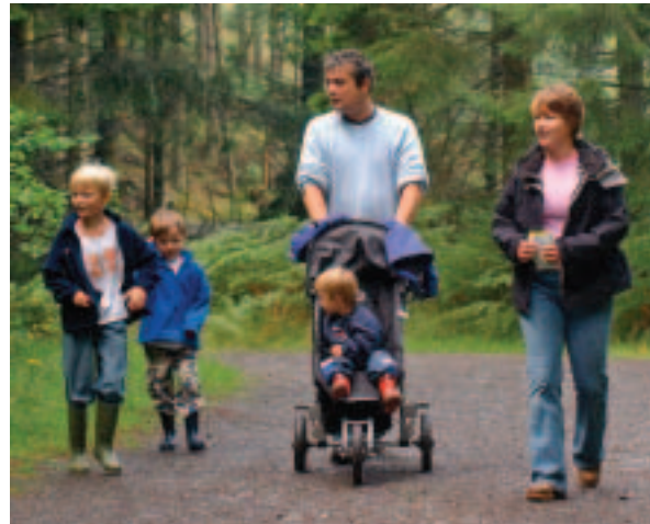
Woodlands offer health and social benefits.