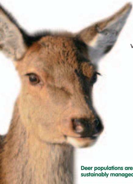
Deer populations are sustainably managed.

The conservation and enhancement of biodiversity is an important objective for forest and woodland management. We use our extensive knowledge of woodland-dwelling species and their ecology to understand how habitats can be managed to sustain valued populations, while controlling populations of damaging species (such as non-native and invasive vertebrates) and their impacts.